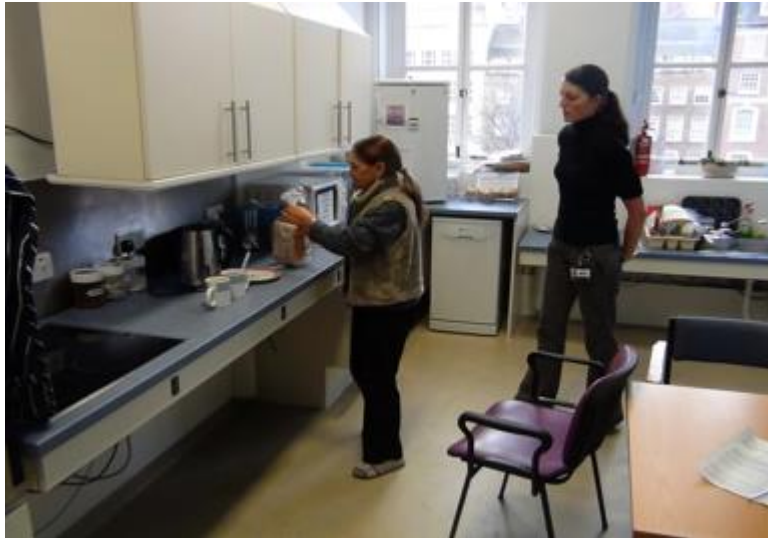
An occupational therapy session in the kitchen

deteriorates on occasion, try not to feel despondent. Graded goal setting can help get you back on track. Go back a few steps (using the steps that you have previously worked through) and gradually grade up your activity again.